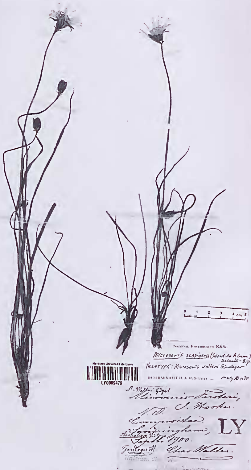
Figure 2. Holotype of M. walteri Gand. (LY 9479, reproduced with permission). Note the spent 'mother tuber' and its replacement tuber on the middle specimen. Other specimens collected without below-ground parts.